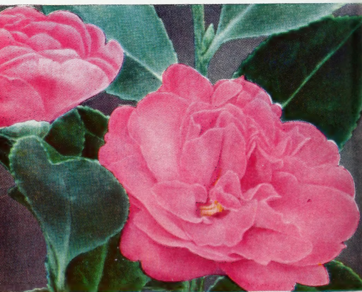
CAMELLIA SASANQUA, SHOWA NO SAKAE